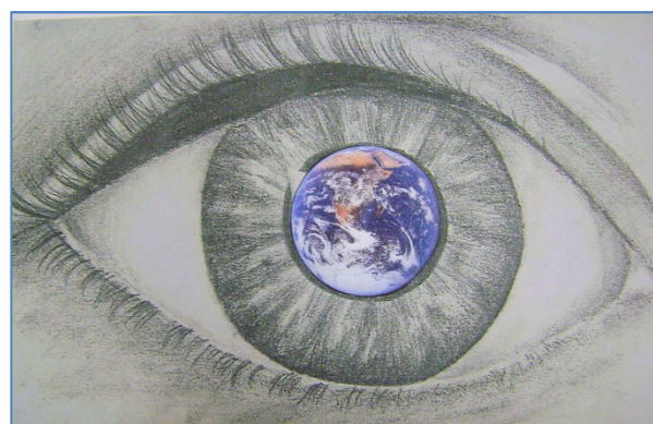
Figure 5: Sarah's Far Reaching Presence for Hema

My collage was created in response to the way that the story framed itself around Sarah's individuality rather than putting her within a structure that could be used in a generic fashion. Her unique vision (shown through her eye) was about pursuing her passions, but was also significant for the way that she used ideas combined with her actions to affect the world (people, things, situations) around her. Despite reading two separate stories, I chose to create one collage because I view Sarah's time through preschool as a continuum (see Figure 5). There were differences in Sarah from one year to the next, but I perceived the changes to be more representative of her growing into the person who she will be rather than her changing as an individual. As I described before, the stories are unique to Sarah as an individual, from my view as her teacher for two years and as someone who still interacts with her regularly. I see her growing within the person who she is and nurturing her skills and qualities in a harmonious manner, not changing them in an unpredictable way.