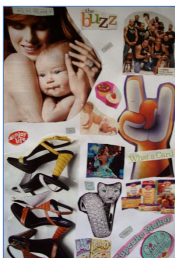
Figure 4: Dianne's Collage 2

The actual collage process for Dianne included first reading the stories again and then “finding things that reflected the stories – specific concrete pictures” (personal interview, 3.24.09). Yet in the process, Dianne began to add her own knowledge of Sarah to the stories. For example, on one collage Dianne added the word ‘icy’, which is not part of the original preschool stories. Her choice to include this word was based on her own experiences with Sarah, knowing