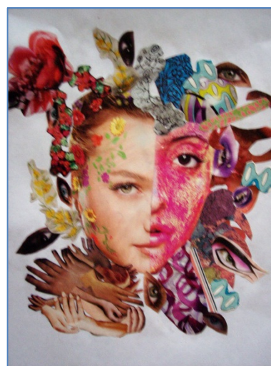
Figure 7: Jeanne's Eyes as a Vision of the World

In the second story, I was immediately drawn to the dichotomy of care and creativity presented in the story. The split face echoes this dichotomy, one side painted in a multiplicity of colour while the other side includes flowers, only grown through the careful care of a nurturing person. On the nurturing side of the face, I included hands and more flowers, again creating a metaphor for care. Through the use of colour, design, and placement on the creative side of the face, I wanted to reflect the infinite number of possibilities through creativity. Eyes are present throughout the collage (see Figure 7). Within the story, although the ideas of care and creativity are prominent these are only implications of how Sarah has come to develop her own vision of the world, always curious, always learning. The eyes are symbolic of this idea.